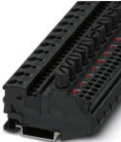
Fuse terminal block for cartridge fuse insert, cross section: 0.5-10 mm 2 , AWG: 20-8, width: 12.2 mm, color: Black

Please be informed that the data shown in this PDF Document is generated from our Online Catalog. Please find the complete data in the user's documentation. Our General Terms of Use for Downloads are valid ( http://phoenixcontact.com/download )